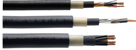
Low AIRGUARD® - Power, VFD, Control and Instrumentation