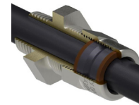
Class 1 Div 2 Unarmored glands