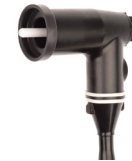
5-28kV 200A Loadbreak Elbows