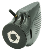
Learn More >