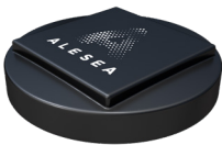
Learn More >