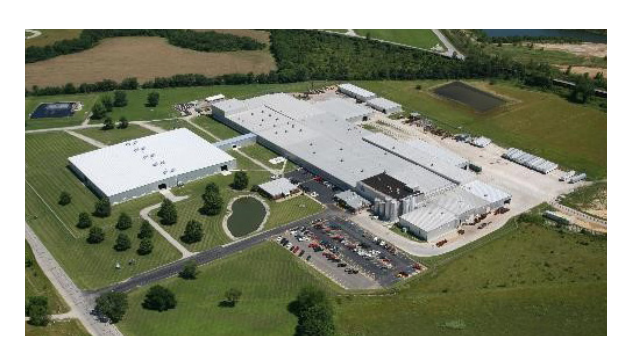
Our Products are proudly manufactured in our Sedalia. Missouri Plant.

Our products are in-stock and readily available for immediate shipping. Reach out now to your Prysmian Group sales representative or call us today at 859-572-8000.